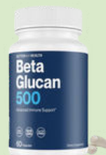
Beta Glucan 1000 mg/svg