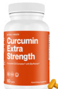
Turmeric Rhizome Extract 1000 mg