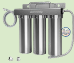
Under Sink Filtration

I have used Waterdrop for 10 years. It consistently provides clean, great-tasting water that I can trust for my family's health. Choose from one of these great options, many more options online.