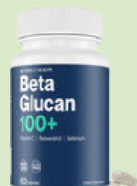
Resveratrol, Vit C, & Selenium!