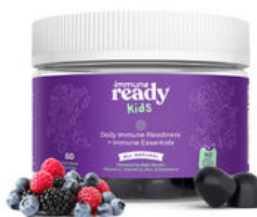
Sugar free! Mixed Berry Flavor