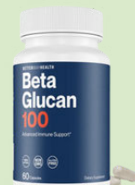
Beta Glucan 200 mg/svg