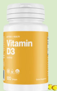
5000 IU Vitamin D/capsule

This vitamin D supplement has been a game-changer for keeping my vitamin D levels high, while also supporting mood, energy, and strong immunity.