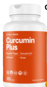
Turmeric Rhizome Extract 500 mg

Whether it's powerful antioxidant support or daily joint comfort, this product helps me stay active and feeling my best.