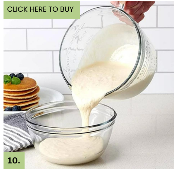
ANCHOR HOCKING BATTER BOWL, 2 QUART GLASS MIXING BOWL