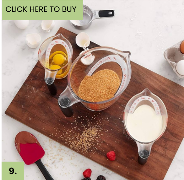
OXO GOOD GRIPS 3-PIECE ANGLED MEASURING CUP SET