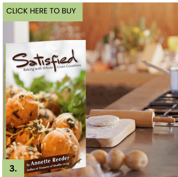
SATISFIED: BAKING WITH WHOLE GRAIN GOODNESS) PRINT BOOK