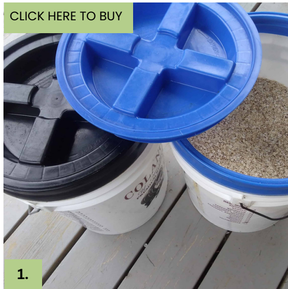
FOOD GRADE BUCKETS WITH GAMMA LIDS