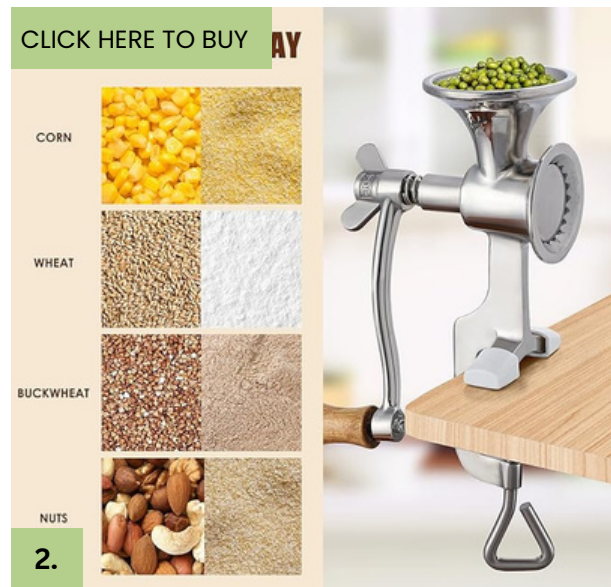
MANUAL GRAIN MILL