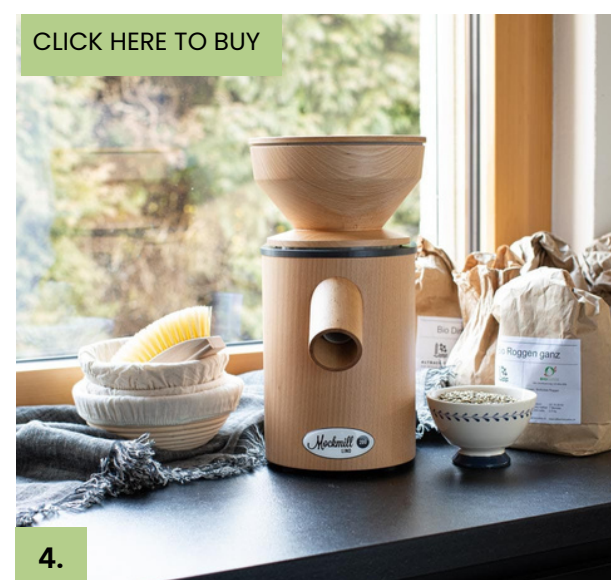
TOP QUALITY ELECTRIC GRAIN MILL