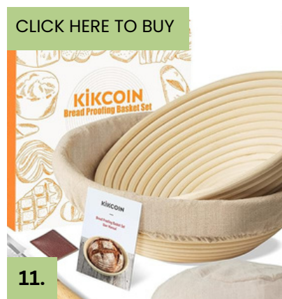
KIKCOIN BREAD PROOFING BASKET SET